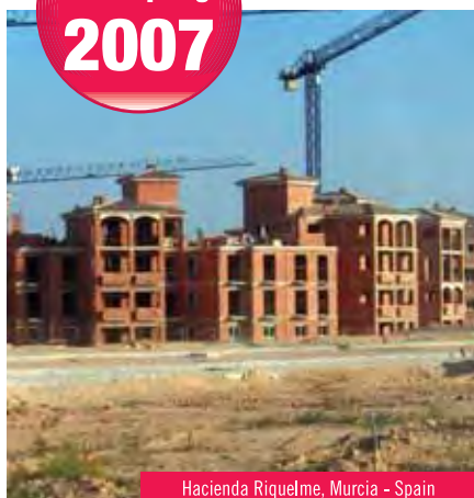
Hacienda Riquelme, Murcia - Spain