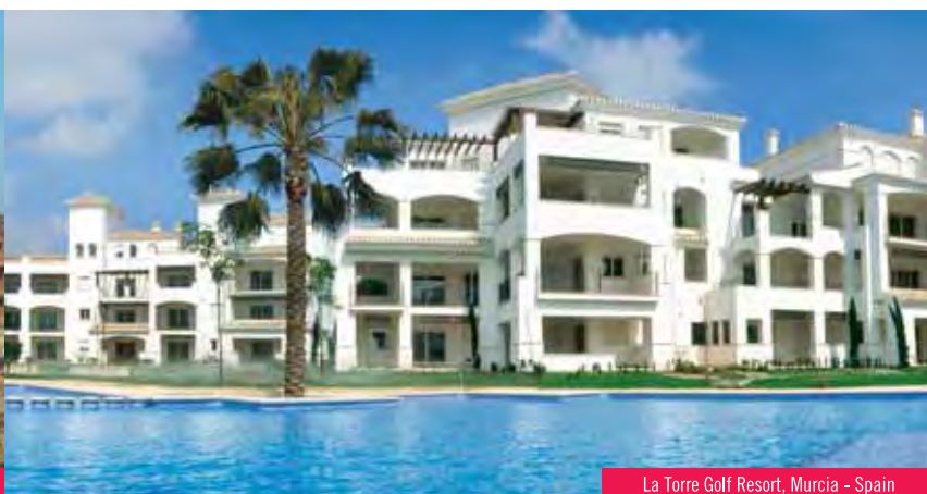
La Torre Golf Resort, Murcia - Spain

With solely front line golf apartments in the same style to those on La Torre Golf Resort, the owners on this resort will have unrivalled views from their property across the golf course and through this, a unique investment opportunity!